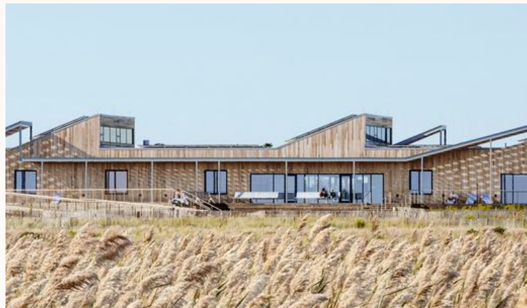
JONES BEACH ENERGY & NATURE CENTER

Over the past 18 years, PureBond® has seen incredible success, being quickly accepted by health-conscious designers and architects . PureBond® has been used in numerous projects requiring FSC® or formaldehyde-free materials, like the Jones Beach Energy & Nature Center in New York, which focuses on the interconnectedness of energy and nature.