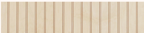
MAPLE BEADED 12IN