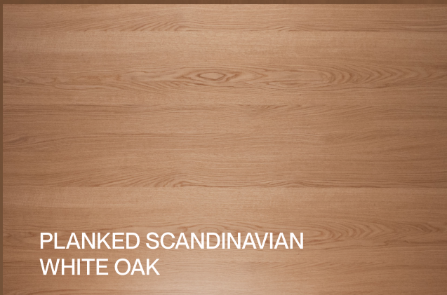
PLANKED SCANDINAVIAN WHITE OAK