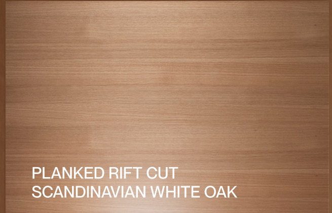
PLANKED RIFT CUT SCANDINAVIAN WHITE OAK