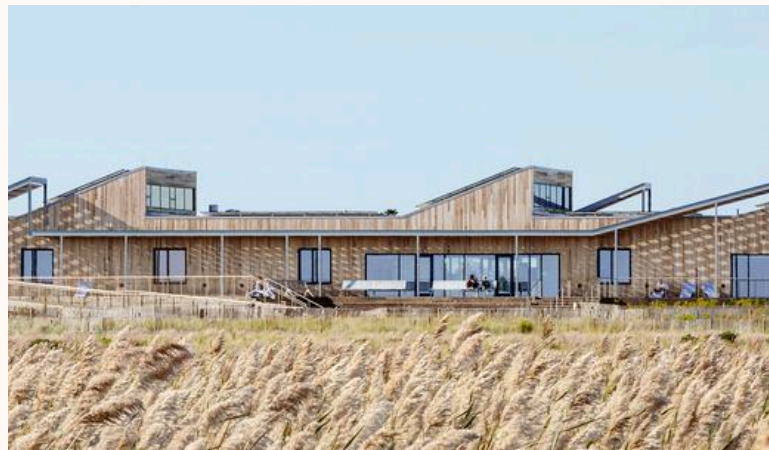
JONES BEACH ENERGY & NATURE CENTER

Over the past 20 years, PureBond® has seen incredible success, being quickly accepted by health-conscious designers and architects . PureBond® has been used in numerous projects requiring FSC® or formaldehyde-free materials, like the Jones Beach Energy & Nature Center in New York, which focuses on the interconnectedness of energy and nature.