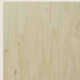
POPLAR CROSSBAND FACE