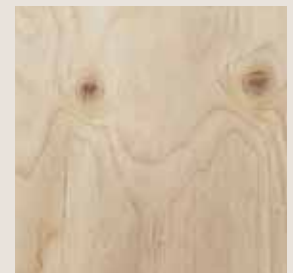
FIR CROSSBAND FACE