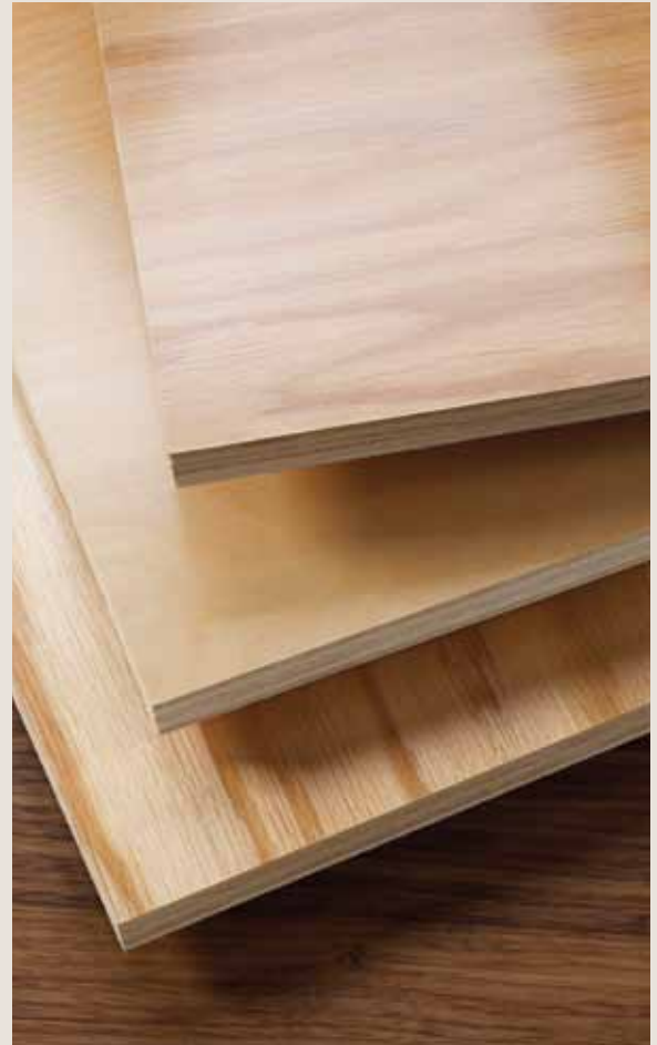
MPX OFFERS A BETTER QUALITY SURFACE FOR THE DECORATIVE FACE.

MPX is perfect for standard fabrications, but is highly recommended for pre-finished panels with high visibility requirements. Fabricators will experience less “fall-down” or scrap as well as fewer reworks and callbacks while producing finer finished goods with higher customer satisfaction and referrals.