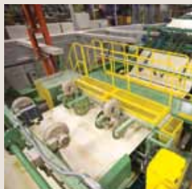
MEINAN LATHE LINES NOW IN OLD FORT, NC AND CRAIGSVILLE, WV

The Meinan-peeled poplar crossband offers a much smoother face as compared to white fir, douglas fir, red pine, white pine and other coarse woods that might be found in a veneer core plywood panel.*